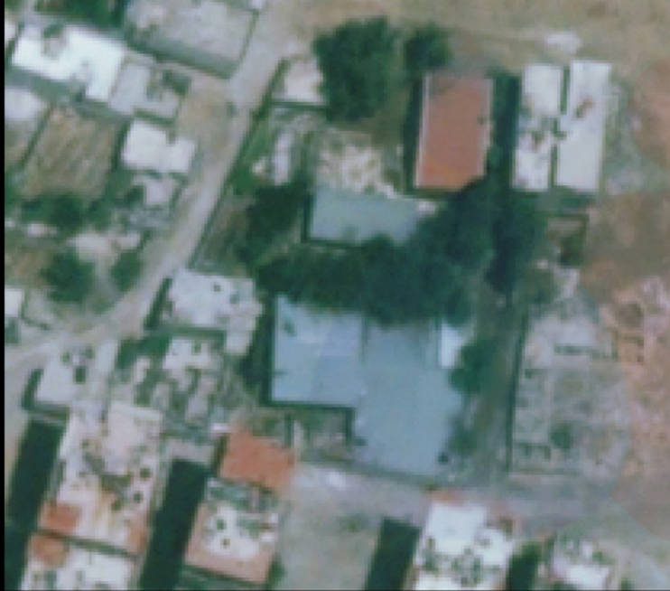
A satellite image for Douma city taken on 14 January 2014