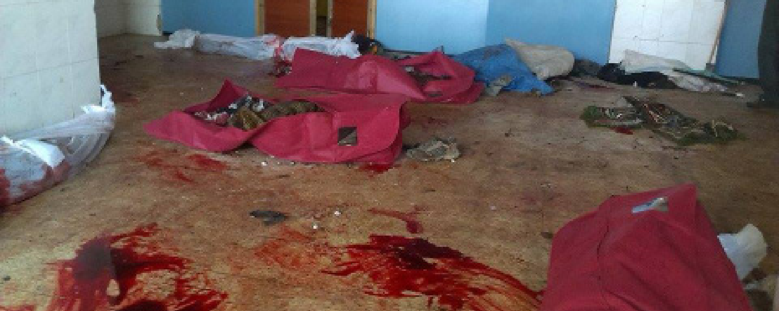
Victims were killed, by government warplanes and artillery shelling, on Hamooreya city - Damascus countryside, on 23 January 2015