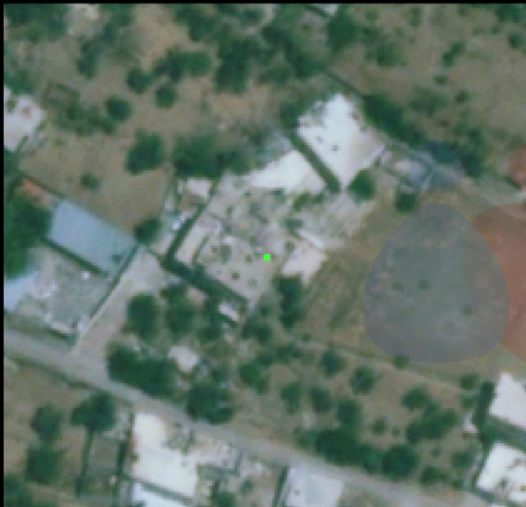
A satellite image for Douma city taken on 14 January 2014