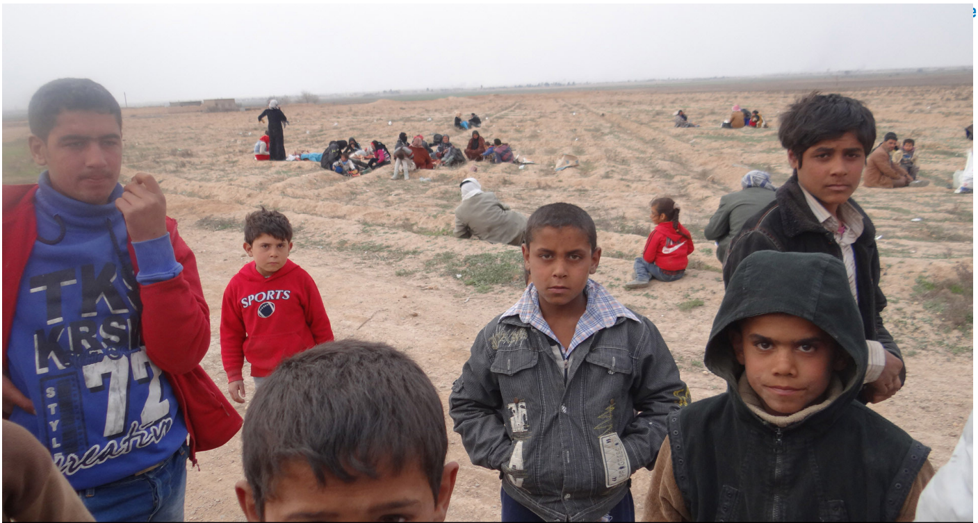
Image shows families from Al Jabour Clan in Al Hasakah countryside displaced by Kurd Self-management forces