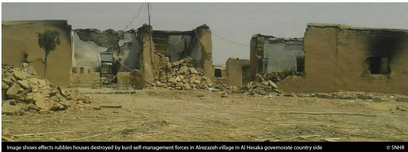
Image shows effects rubbles houses destroyed by kurd self-management forces in Alrezazeh village in Al Hesaka governorate country side