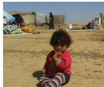
Several images that depict Arabs who were displaced from Al Hassaka suburbs

Several images which depicts displaced families from Al Jabour tribe in Al Hassaka suburbs due to the KSM actions.