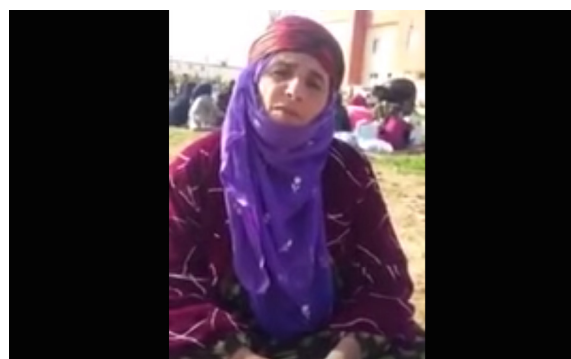
- Turkey – March 2015:

- A video that depicts a man from Tal Hamees town who claims that International Coalition forces supported the KSM forces in killing civilians. He says that almost 150 families were displaced from Tal Hamees.