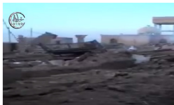
- A video that depicts the destruction effects in some houses in Al Hawsawiya town next to Tal Hamees.

A video that depicts an elderly woman who says that she was displaced from her town by the KSM forces. KSM forces looted the several herds and burned several houses in the town.