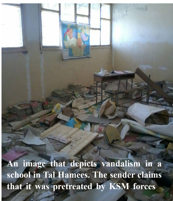
An image that depicts vandalism in a school in Tal Hamees. The sender claims that it was pretreated by KSM forces