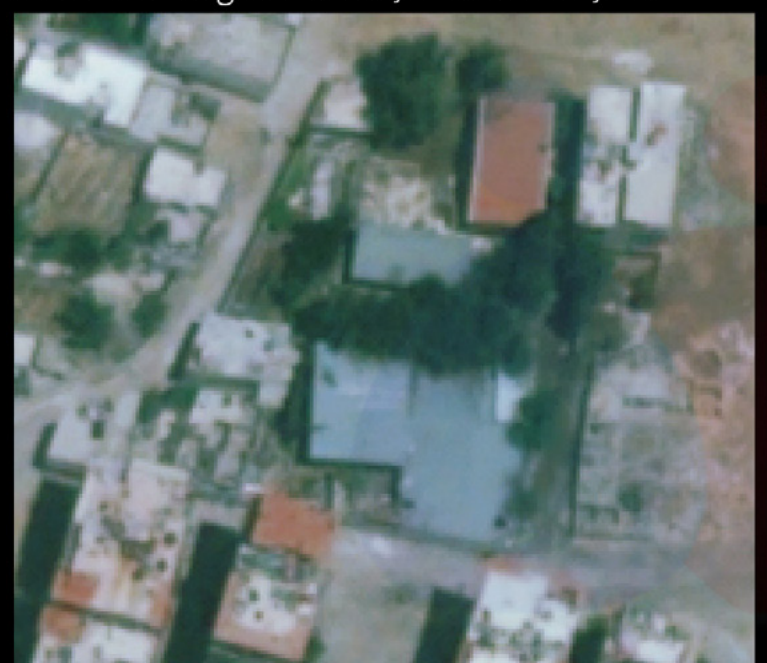
A satellite image for Douma city taken on 1 January 2015