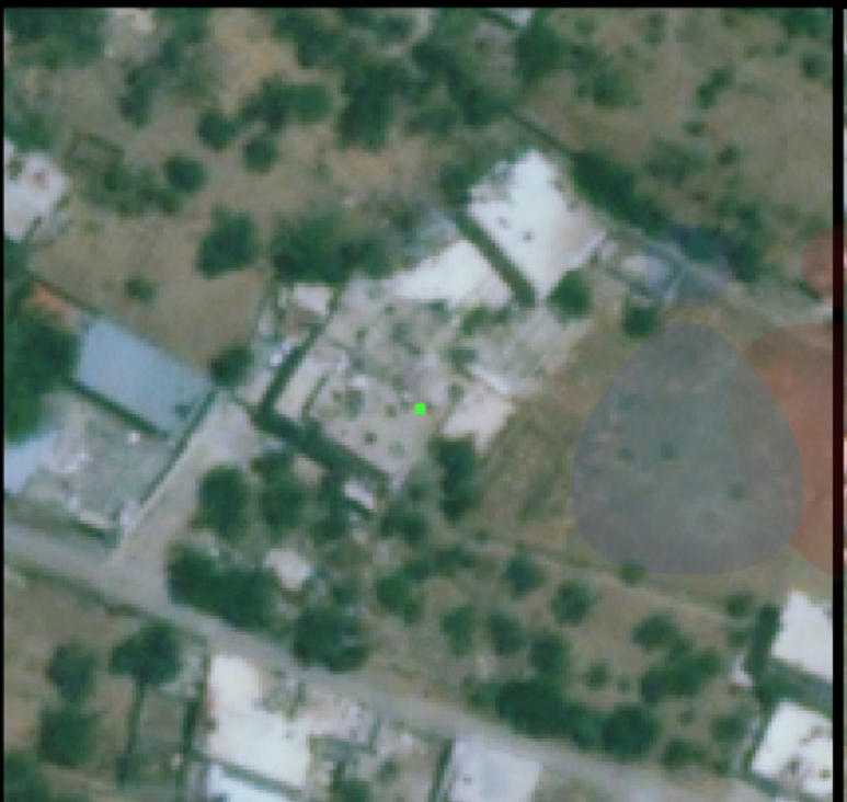
A satellite image for Douma city taken on 1 January 2015