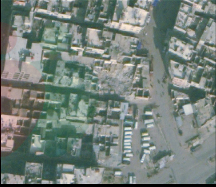
The first image was taken before UN Security Council resolution 2139 was issued. The second image was taken after the resolution was issued and depicts the widespread destruction and the regime's recklessness towards the Security Council resolutions.

On 27 March 2015, government warplanes launched a rocket on the market in Harsta Al-Qantra town. The shelling killed 9 individuals, and injured around 140 others. Also, a number of shops were damaged.