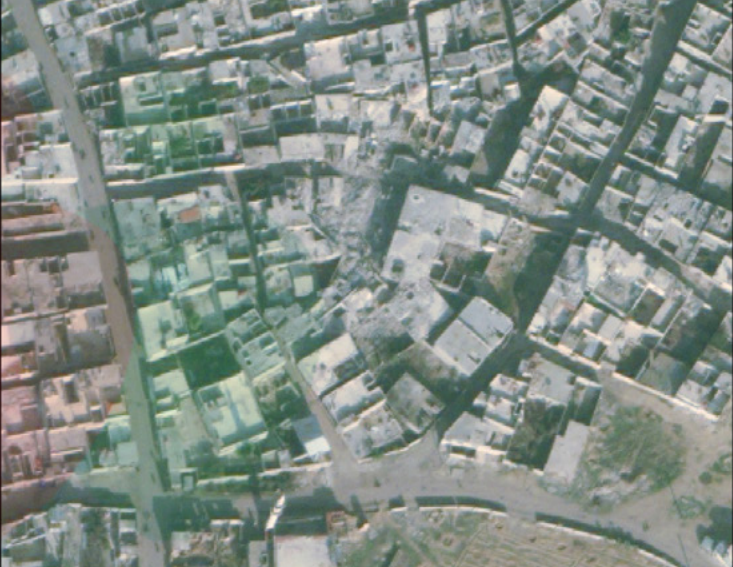
The first image was taken before UN Security Council resolution 2139 was issued. The second image was taken after the resolution was issued and depicts the widespread destruction and the regime's recklessness towards the Security Council resolutions.