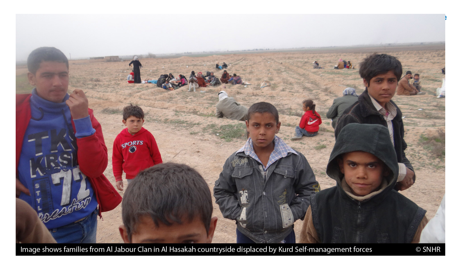
D. Forced Displacement:

Widespread violations that were committed by the KSM forces, which had ethnic dimensions sometimes; led to the displacement of tens of thousands of the governorate's residents, mostly Arabs, where dozens of other towns are still vacant of its inhabitants.