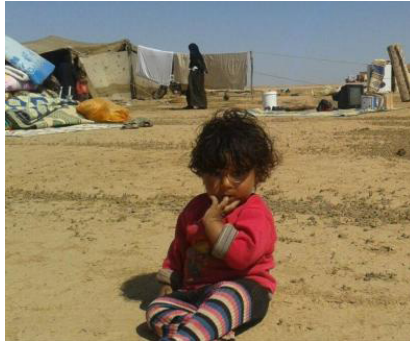
Several images that depict Arabs who were displaced from Al Hassaka suburbs

Several images which depicts displaced families from Al Jabour tribe in Al Hassaka suburbs due to the KSM actions.