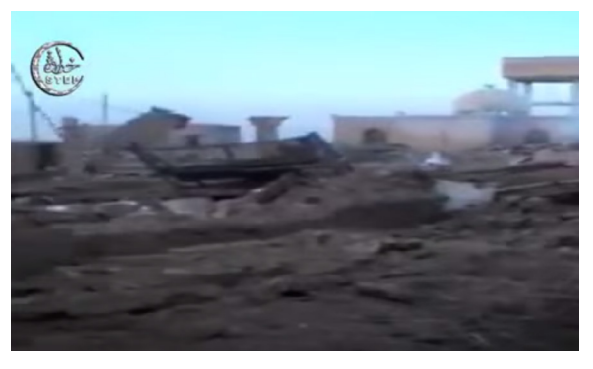
- A video that depicts the destruction effects in some houses in Al Hawsawiya town next to Tal Hamees.

A <u>video</u> that depicts an elderly woman who says that she was displaced from her town by the KSM forces. KSM forces looted the several herds and burned several houses in the town.