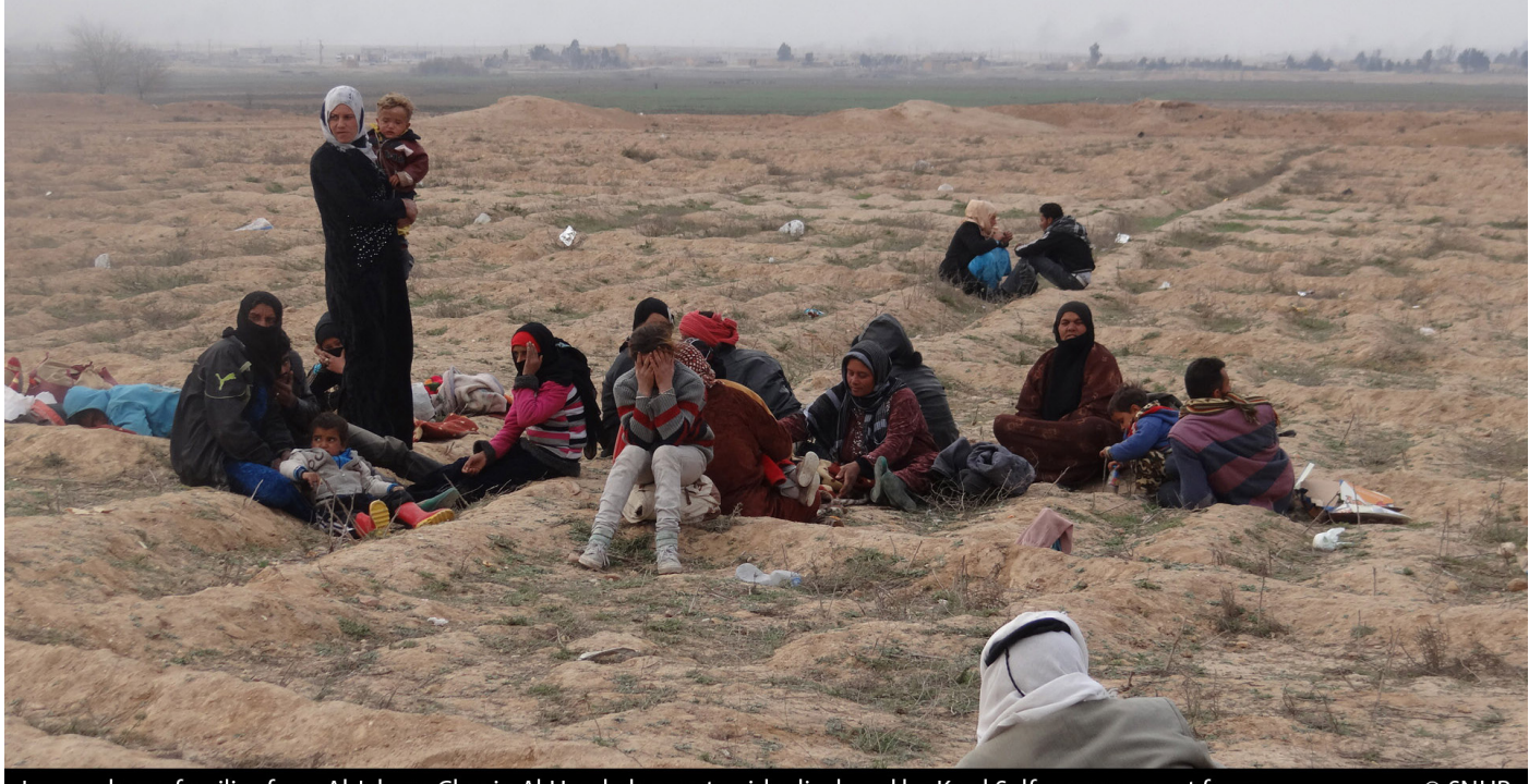
Image shows families from Al Jabour Clan in Al Hasakah countryside displaced by Kurd Self-management forces