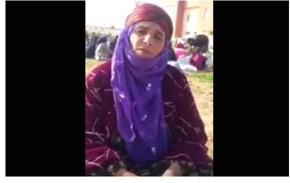
- Turkey - March 2015:

A <u>video</u> that depicts an elderly woman who says that she was displaced from her town by the KSM forces. KSM forces looted the several herds and burned several houses in the town.