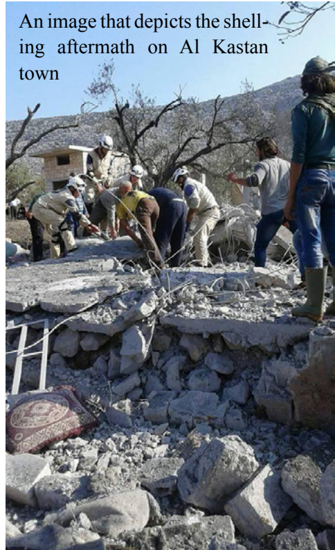
An image that depicts the shelling aftermath on Al Kastan town

“The market was targeted by a Russian warplane at about 9 a.m. I went with my team to the shelling location and started to pull the victims” bodies from under the rubble. We pulled a child’s body from under the rubble of her house; she had turned to body parts. The shelling destroyed several shops and equipment as it also killed 4 individuals including 3 children. The residents told us that the Russian warplanes launched three rockets. However, after visiting the shelling site, we learned that the warplanes launched 4 not 3 rockets and one warplane launched the airstrike. There are a lot of differences the Syrian the and Russian regimes’ shelling including the sound of the warplane and its altitude. Also, Russian warplanes fly in squadrons, then they separate from each other then shell different regions. After they finish their airstrike, they form a squadron again and return to their base.”