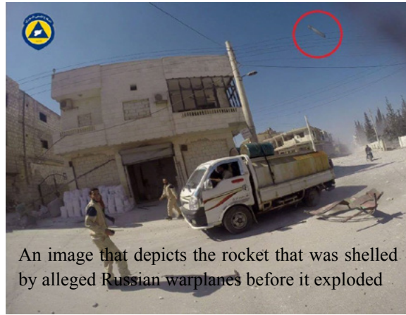
An image that depicts the rocket that was shelled by alleged Russian warplanes before it exploded

An image of the civil defense member who was killed due to the alleged Russian shelling