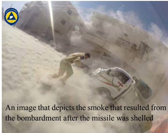
An image that depicts the smoke that resulted from the bombardment after the missile was shelled