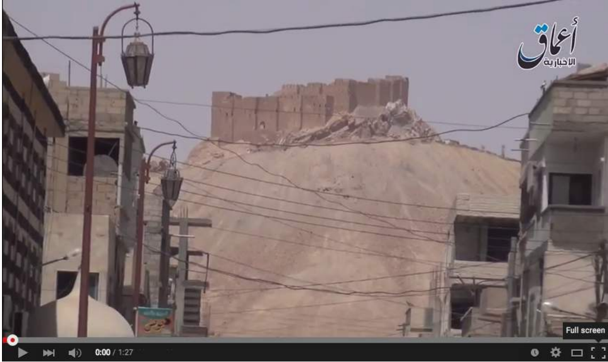
Citadel (Qalaat Shirkuh), Palmyra, footage attributed to ISIL (APSA; May 26, 2015)