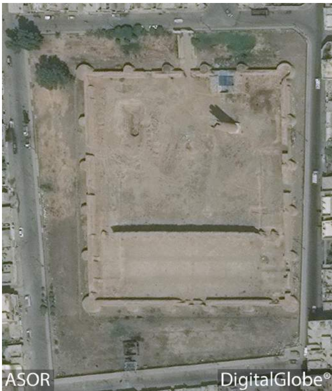
ASOR DigitalGlobe® Great Mosque, Raqqa, with no visible damage (DigitalGlobe; September 5, 2015)