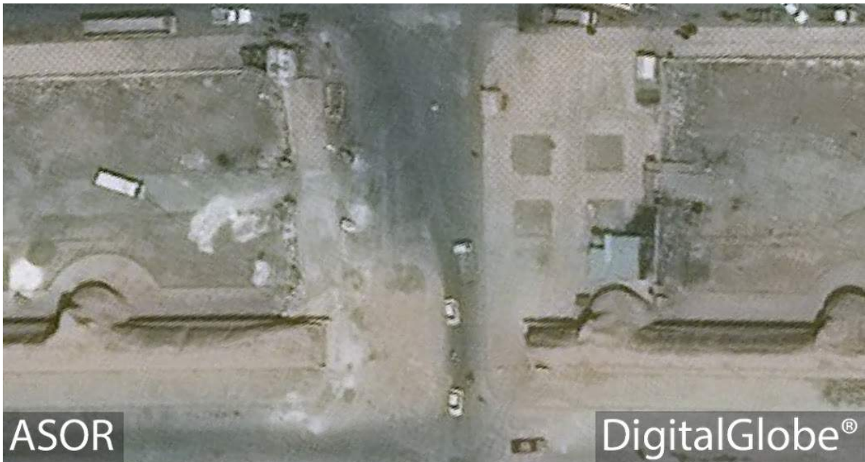
Bab Harran northern gate, Raqqa, with visible damage and debris cleared (DigitalGlobe; September 5, 2015)