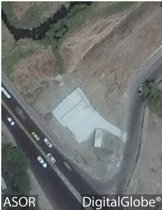
South Area, construction of large building in the south western corner (DigitalGlobe; August 29, 2015)