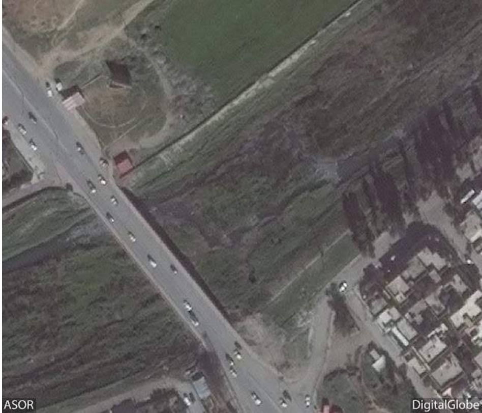
South Area (March 7, 2015)