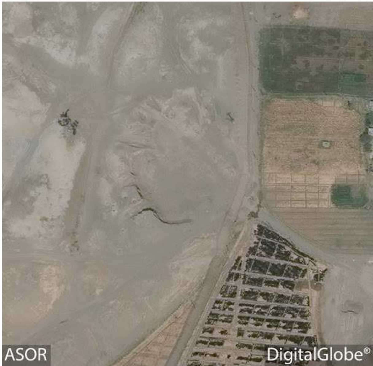
Tell Bi'aa, digging of mound expanded further (DigitalGlobe; September 5, 2015)