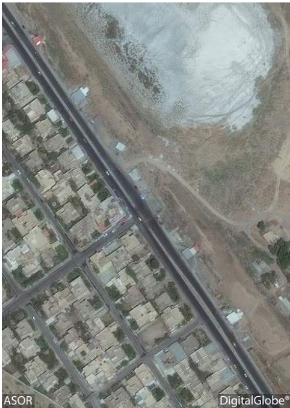
Western Area, new construction along edge of Nineveh (DigitalGlobe; August 29, 2015)