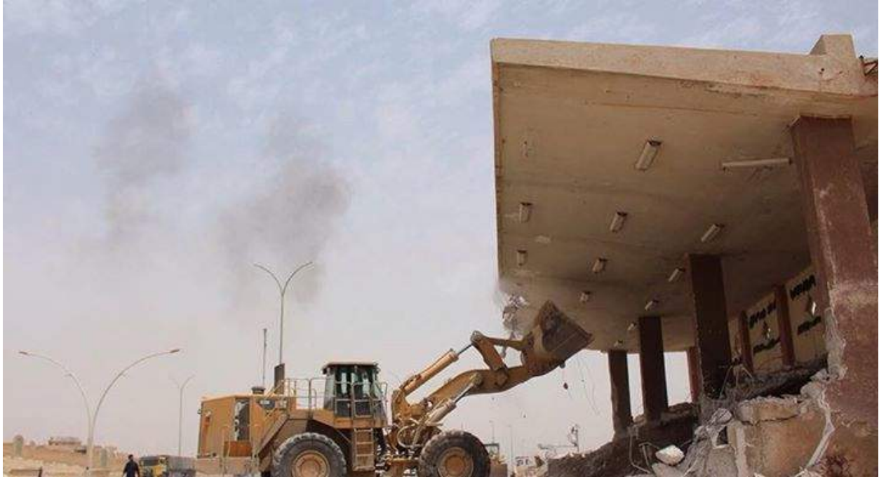
Demolition of the stadium (June 23, 2015)