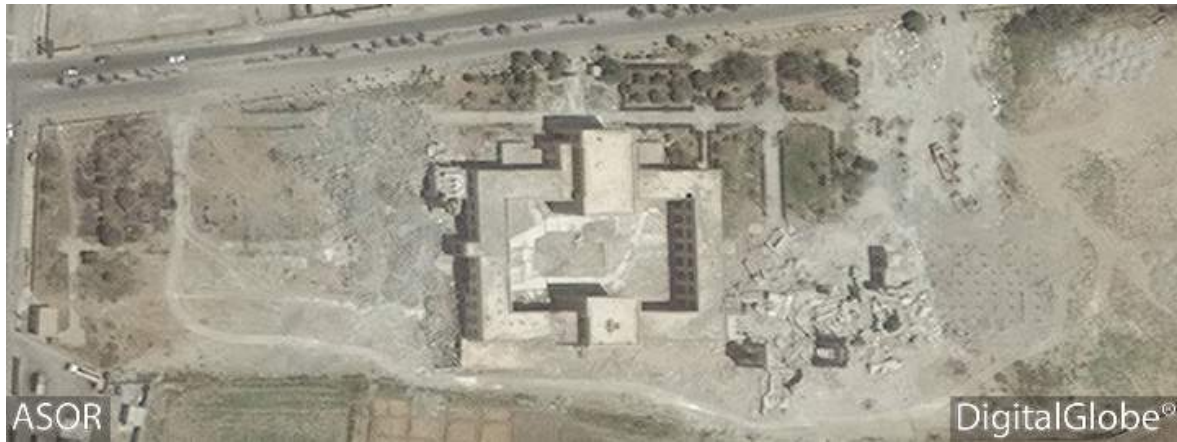
Shrine to Uwais al-Qurani and Ammar Bin Yasser with visible damage to the southeast corner (DigitalGlobe; June 19, 2014)