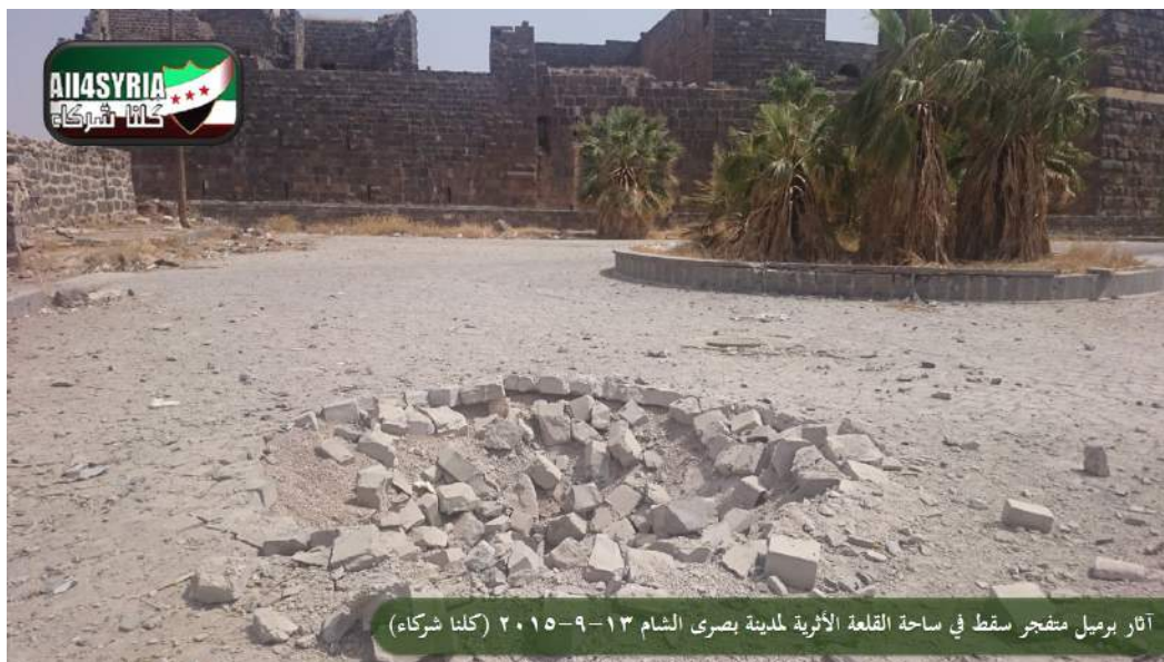
Busra al-Sham Citadel Courtyard showing bomb damage. (September 16, 2015)

UNESCO: http://whc.unesco.org/en/list/22