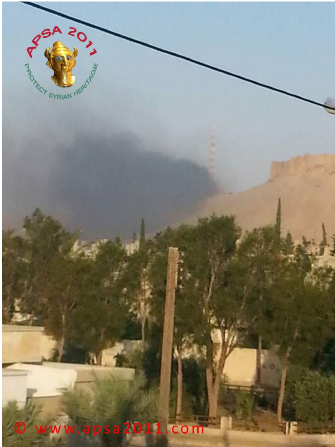
Palmyra, bombardment in the area of the citadel (APSA; May 15, 2015)