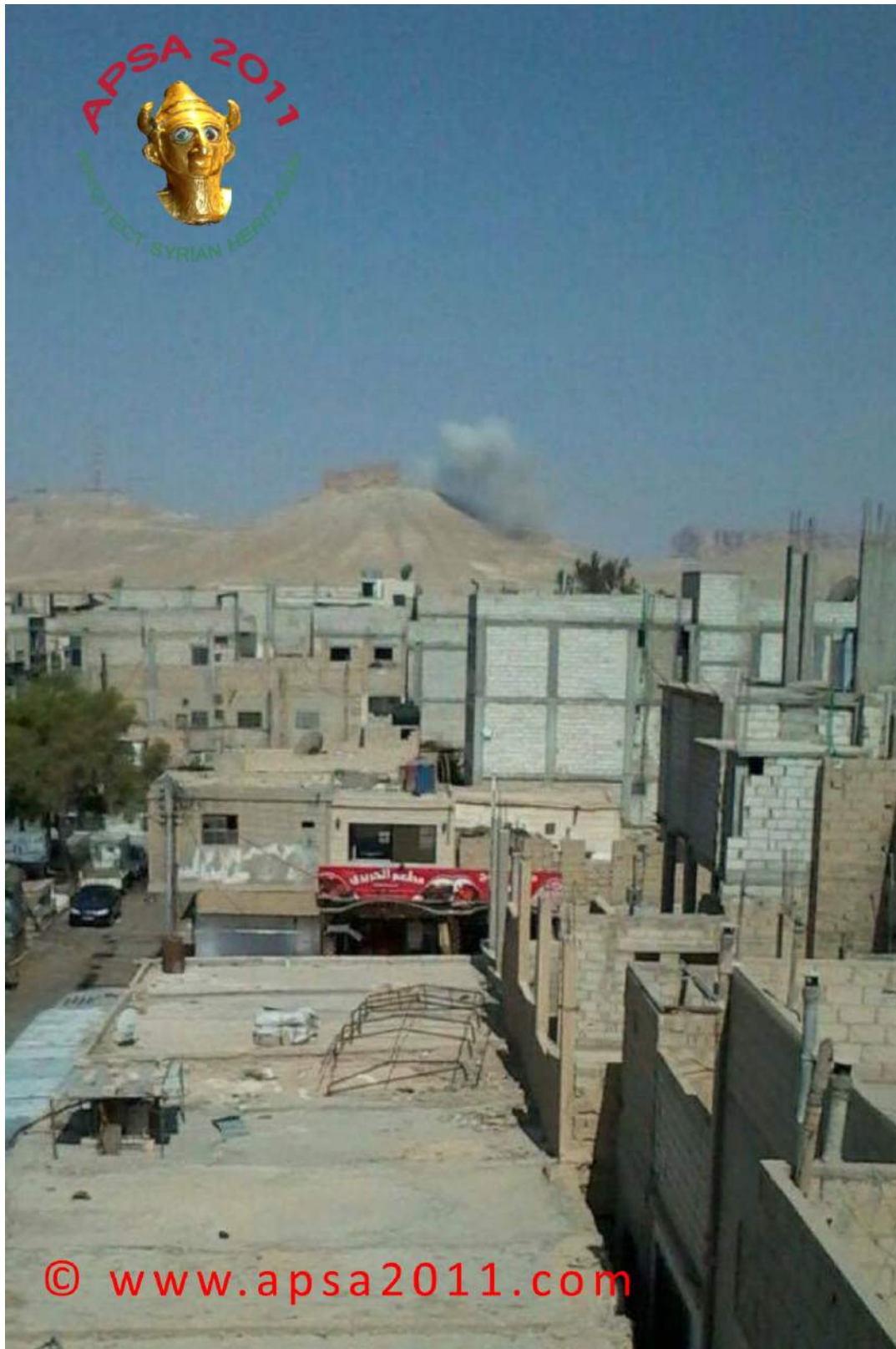
Palmyra, bombardment in the area of the citadel (APSA; May 15, 2015)