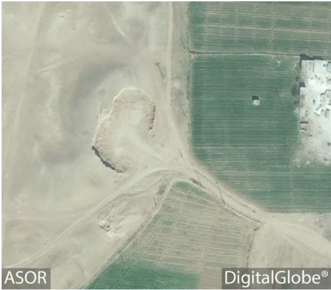
Tell Bi'aa, evidence of earth removal/looting on southeast side of mound (DigitalGlobe; February 12, 2014)