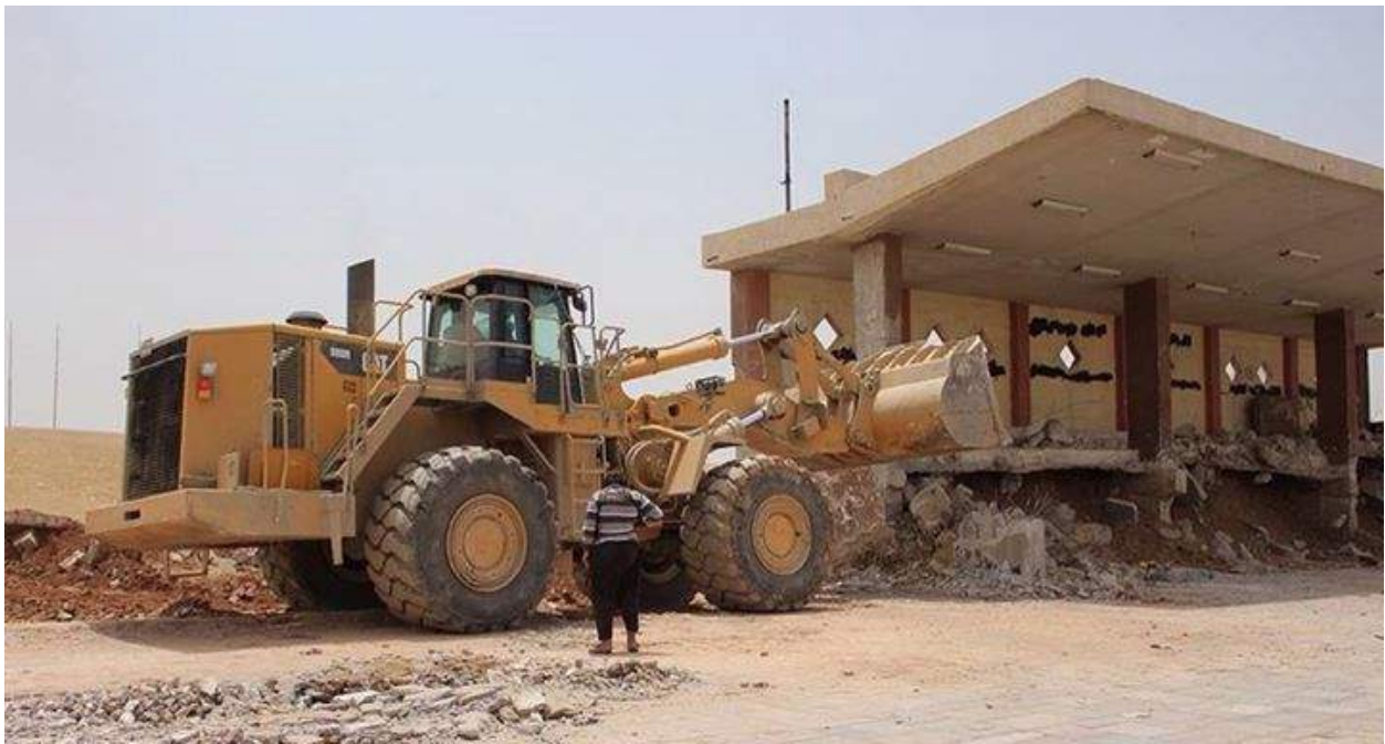
Demolition of the stadium (Facebook; June 23, 2015)