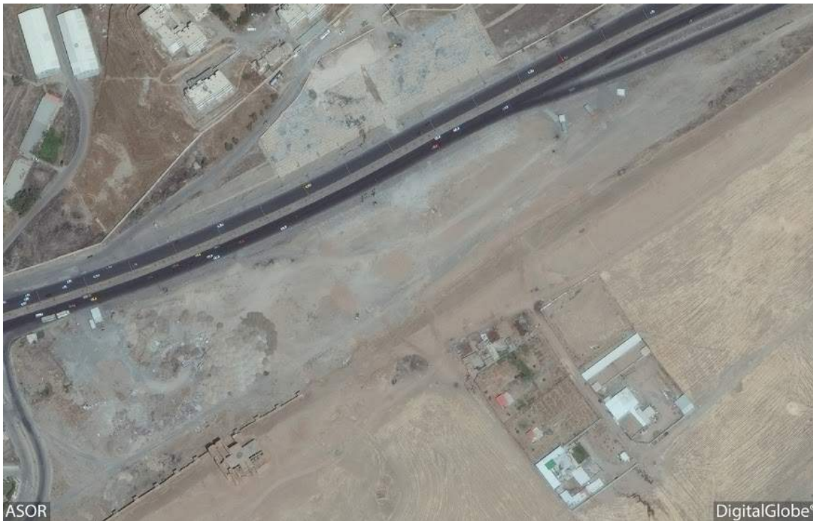
ASOR DigitalGlobe® North Area with stadium demolished and a new large complex south of the northern wall (DigitalGlobe; August 29, 2015)