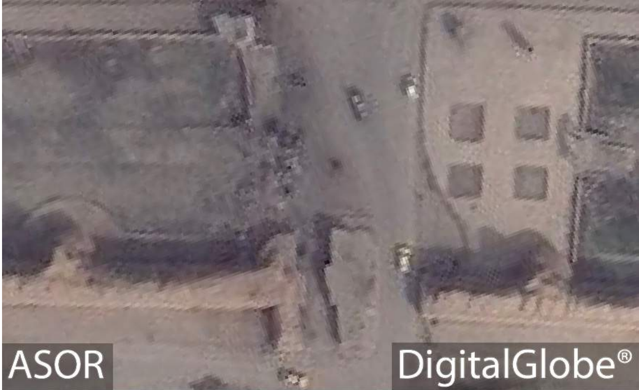
Bab Harran northern gate, Raqqa, without visible damage (DigitalGlobe; February 7, 2015)