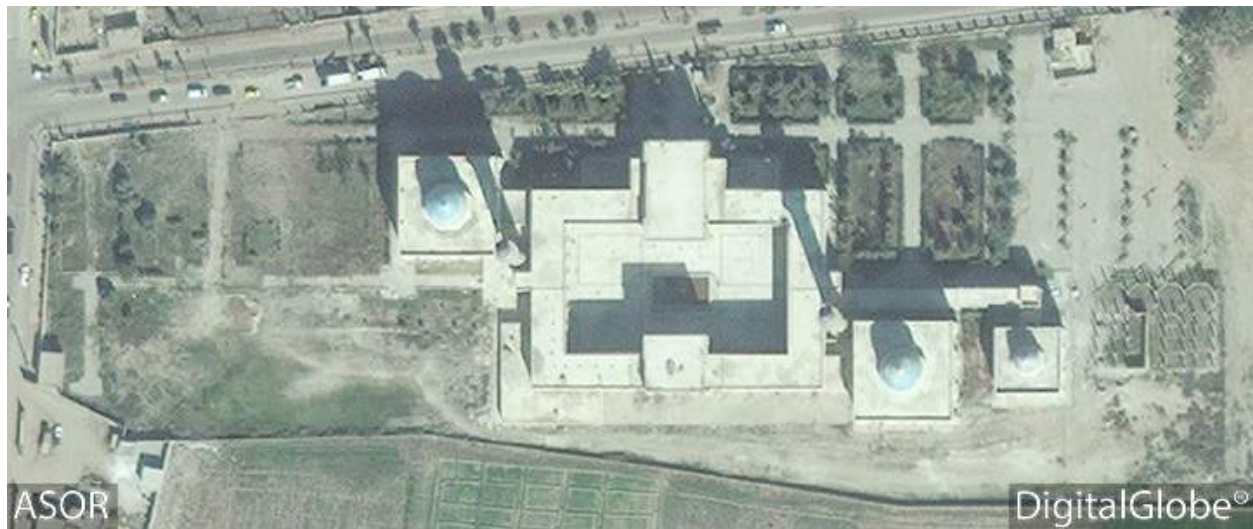
Shrine to Uwais al-Qurani and Ammar Bin Yasser, Raqqa, with no visible damage ( February 12, 2014)