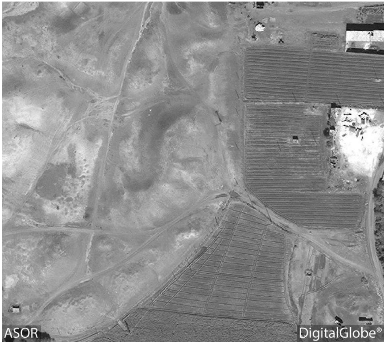
Tell Bi'aa, no recent, visible damage in the southeast quadrant (October 22, 2013)