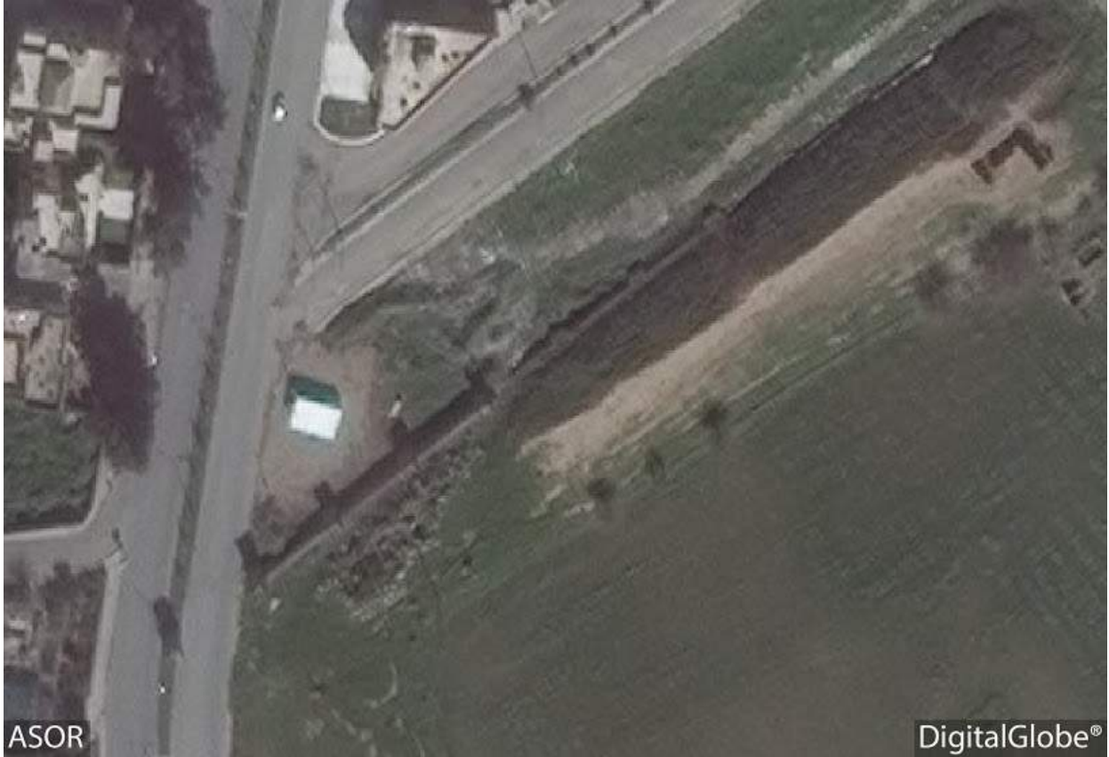
Northwest Area (DigitalGlobe; March 7, 2015)