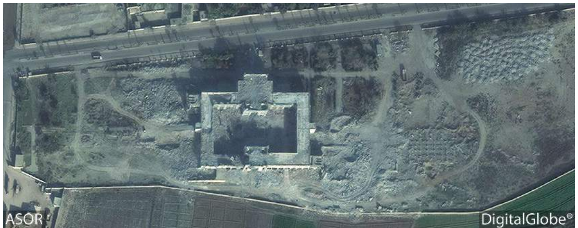
Shrine to Uwais al-Qurani and Ammar Bin Yasser with visible damage to the center (January 9, 2015)