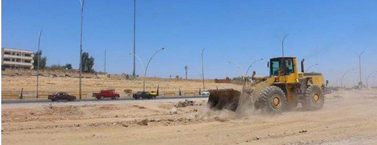
Demolition of the stadium (June 23, 2015)