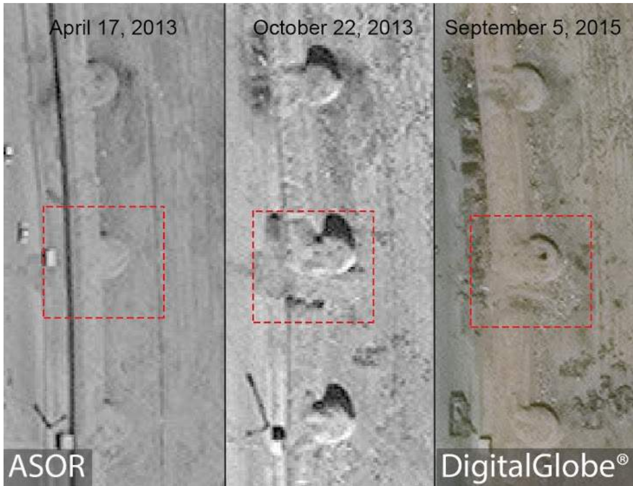
City wall directly across the street from Bab Harran, Raqqa, with visible damage (DigitalGlobe; September 5, 2015)