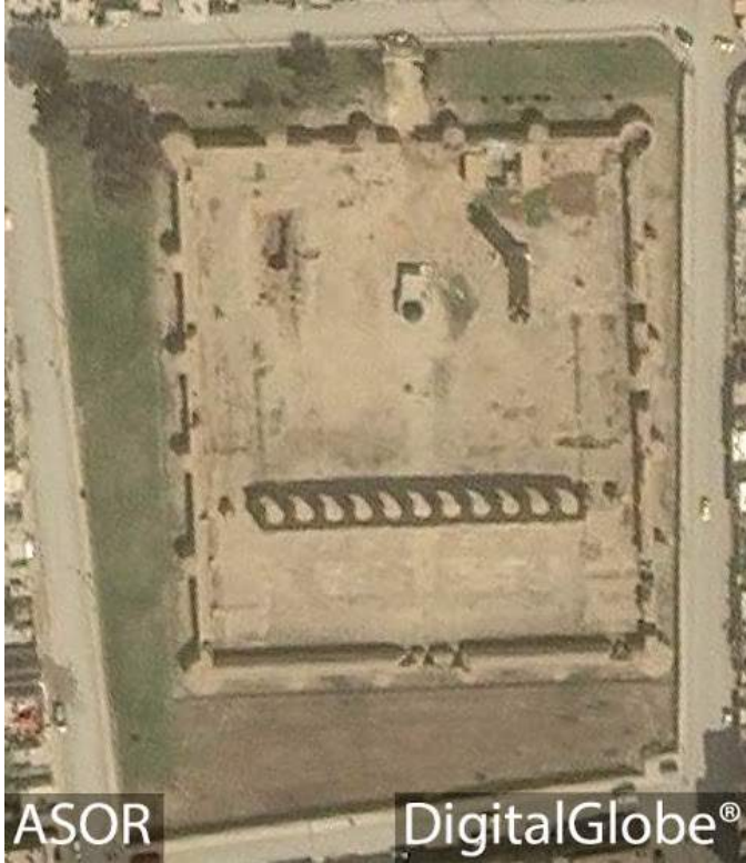
ASOR DigitalGlobe® Great Mosque, Raqqa, with no visible damage (DigitalGlobe; April 8, 2011)