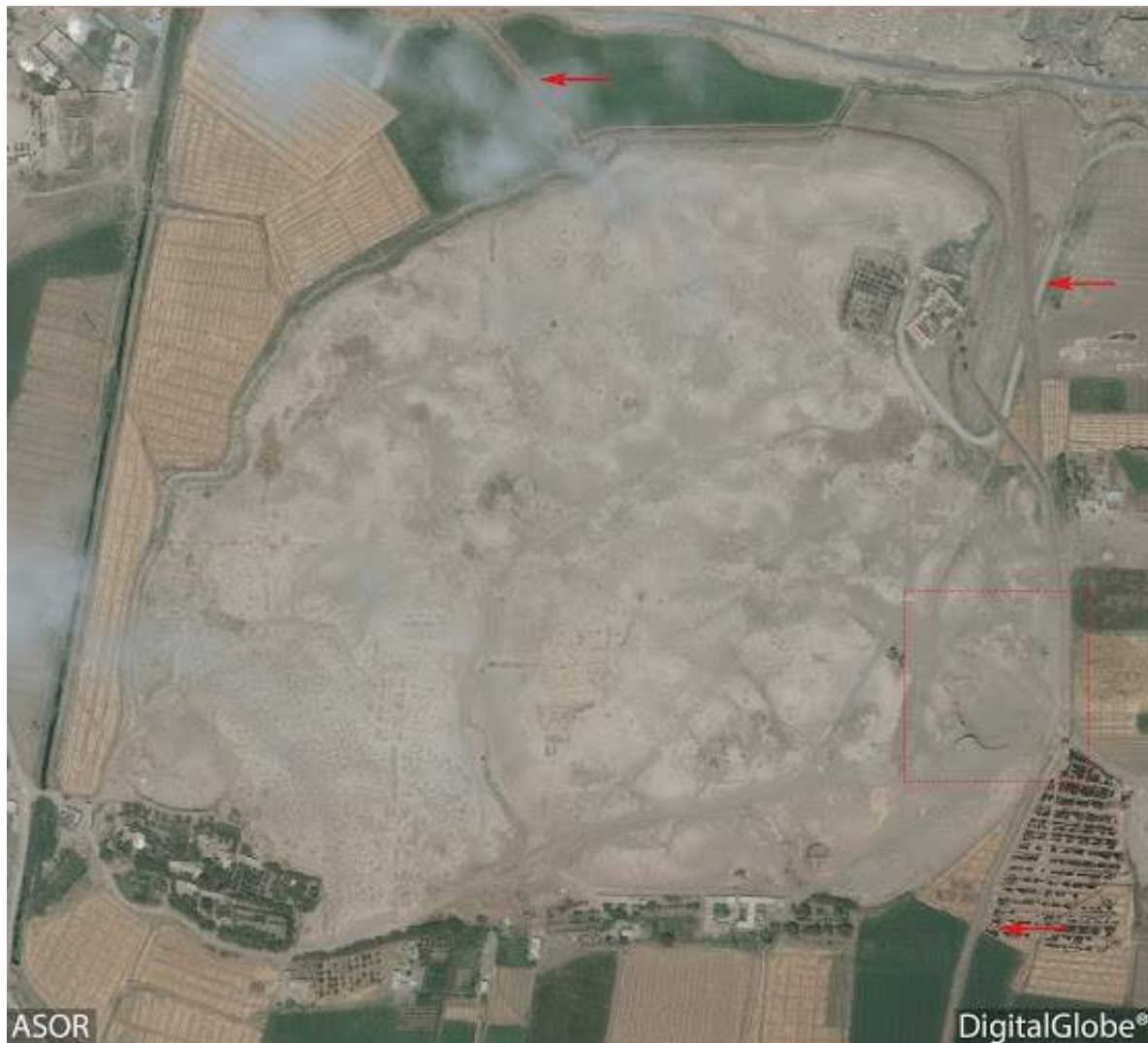
Mound of Tell Bi'aa, areas of interest highlighted in red (September 5, 2015)

UNITAR 2014. Satellite-based Damage Assessment to Cultural Heritage Sites in Syria . (UNITAR). http://www.unitar.org/unosat/chs-syria