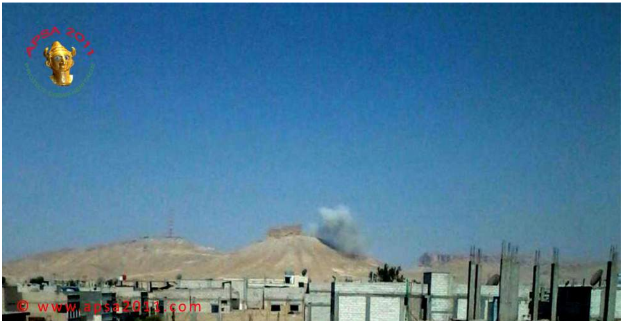
Palmyra, bombardment in the area of the citadel (APSA; May 15, 2015)