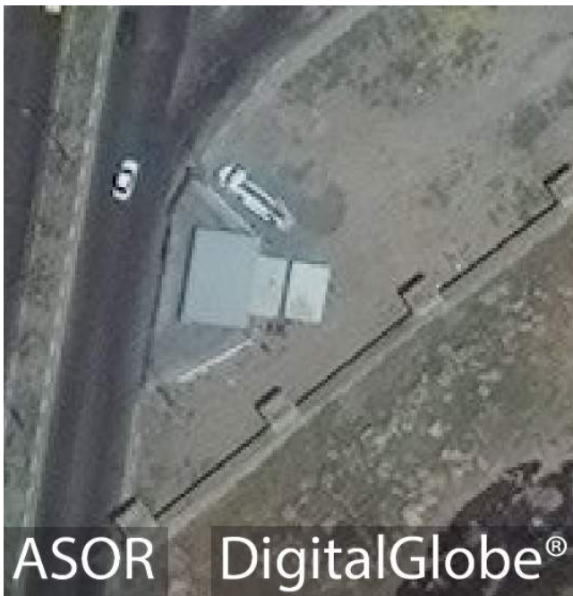
Northwest Area, construction of new enlarged building (August 29, 2015)