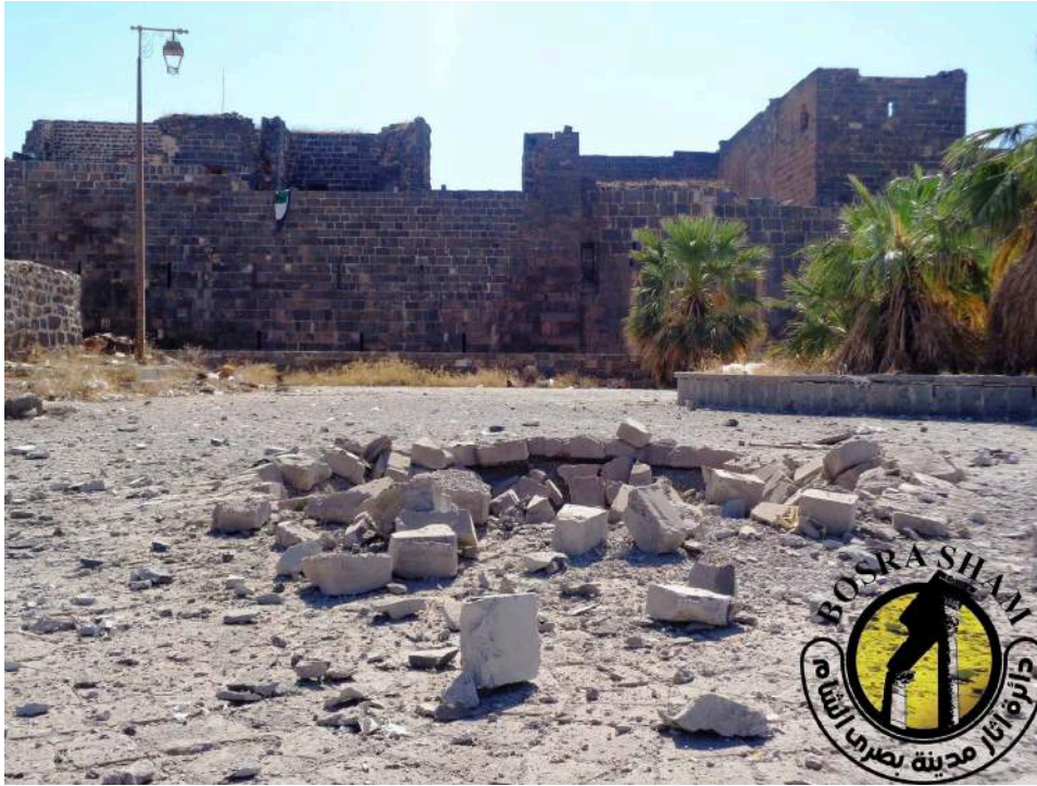
Busra al-Sham Citadel Courtyard showing bomb damage (Facebook; September 16, 2015)