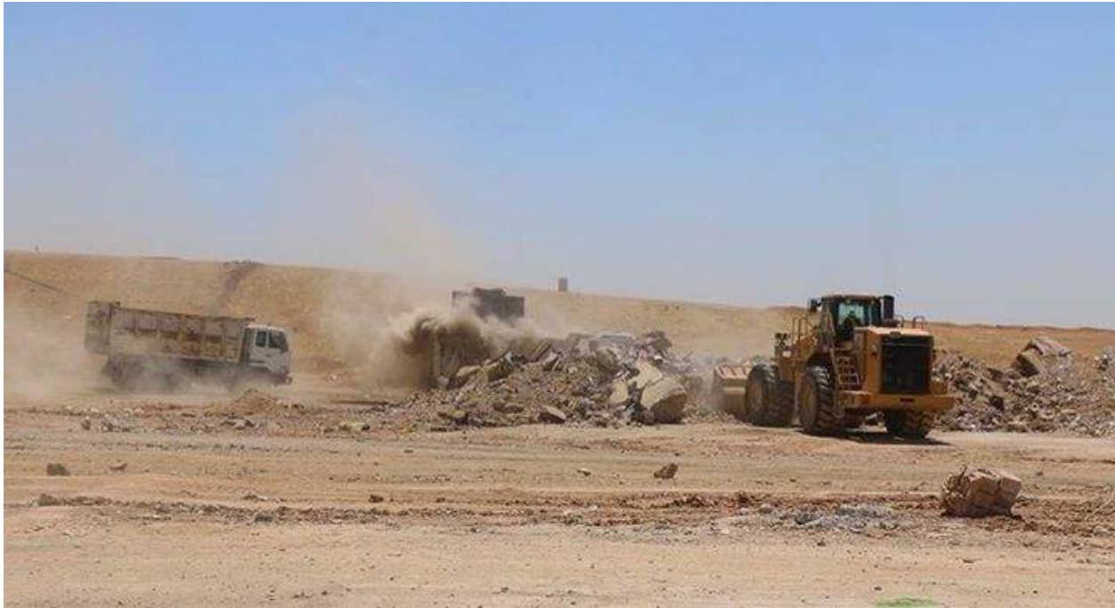
Demolition of the stadium (Facebook; June 23, 2015)