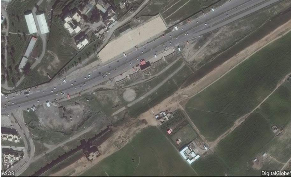
ASOR DigitalGlobe® North Area with Spring Festival Stadium (DigitalGlobe; March 7, 2015)