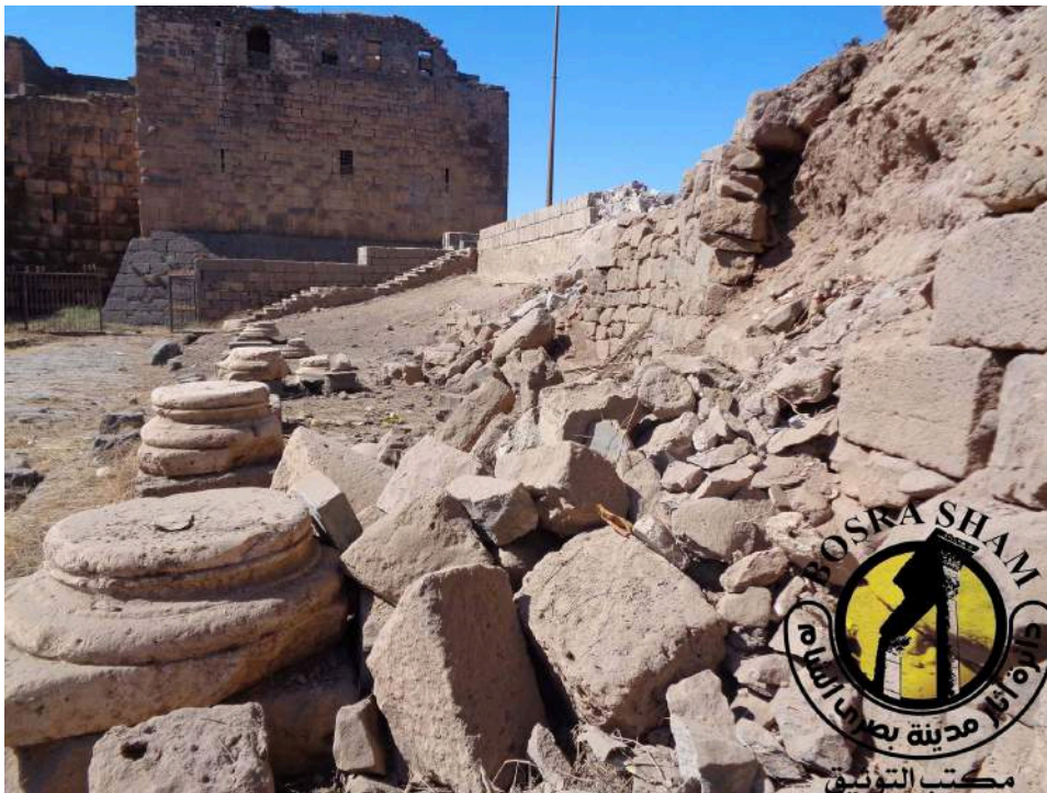
Busra al-Sham Citadel Courtyard showing bomb damage.