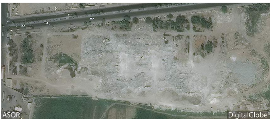
Cleared site of the Shrine to Uwais al-Qurani and Ammar Bin Yasser (September 9, 2015)