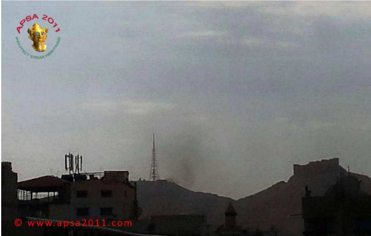
Palmyra, bombardment in the area of the citadel (May 15, 2015)