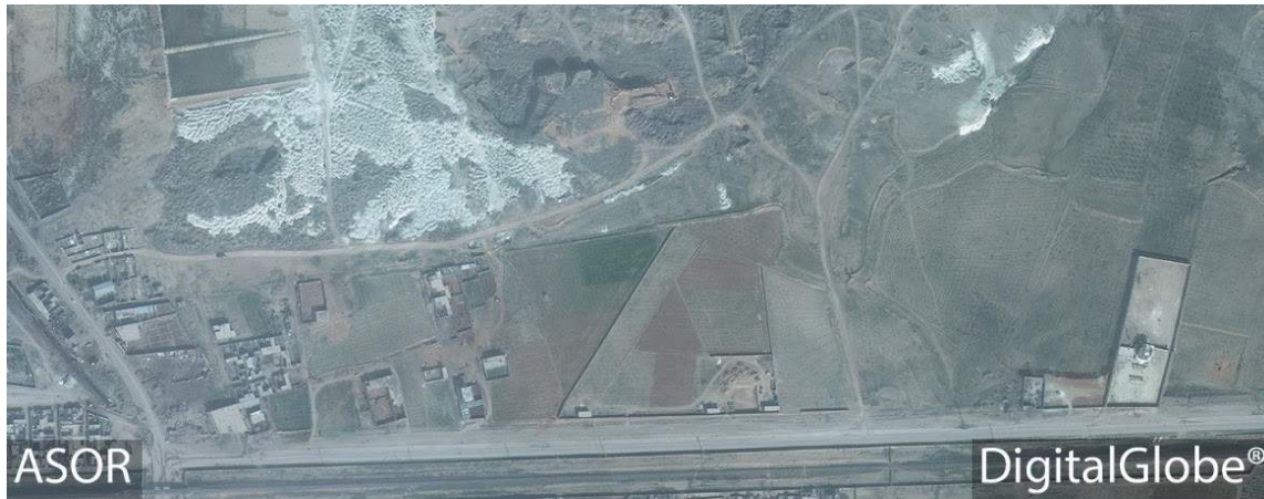
Embankments around the northern edge of the city and around neighboring Tell Bi'aa (February 2, 2015)