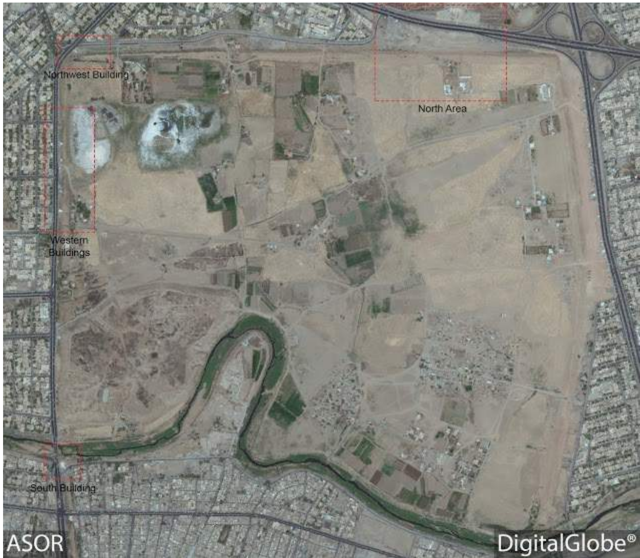
Nineveh, areas of interest outlined in red (August 29, 2015)