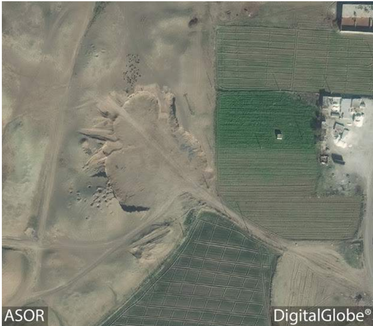
Tell Bi'aa, earth removal expanded in multiple directions and looting pits and access ramps are visible (DigitalGlobe; January 9, 2015)