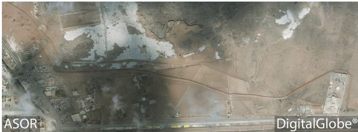
Construction of embankments on the northern edge of the city (September 5, 2015)