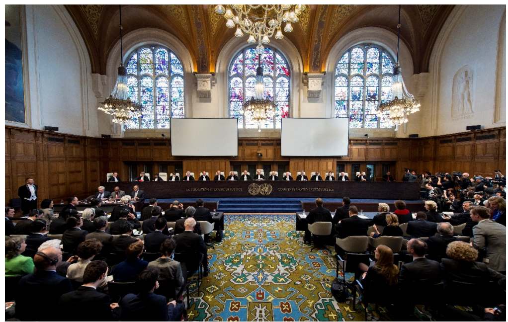
The International Court of Justice Courtroom.

conclusively shown" that plans to commit genocide at Srebrenica were communicated to Serbian authorities. <sup>227</sup> Therefore, Bosnia and Herzegovina had not "conclusively established" that Serbia had "supplied aid to the perpetrators of the genocide in full awareness that the aid supplied would be used to commit genocide," which is required to demonstrate complicity. <sup>228</sup>