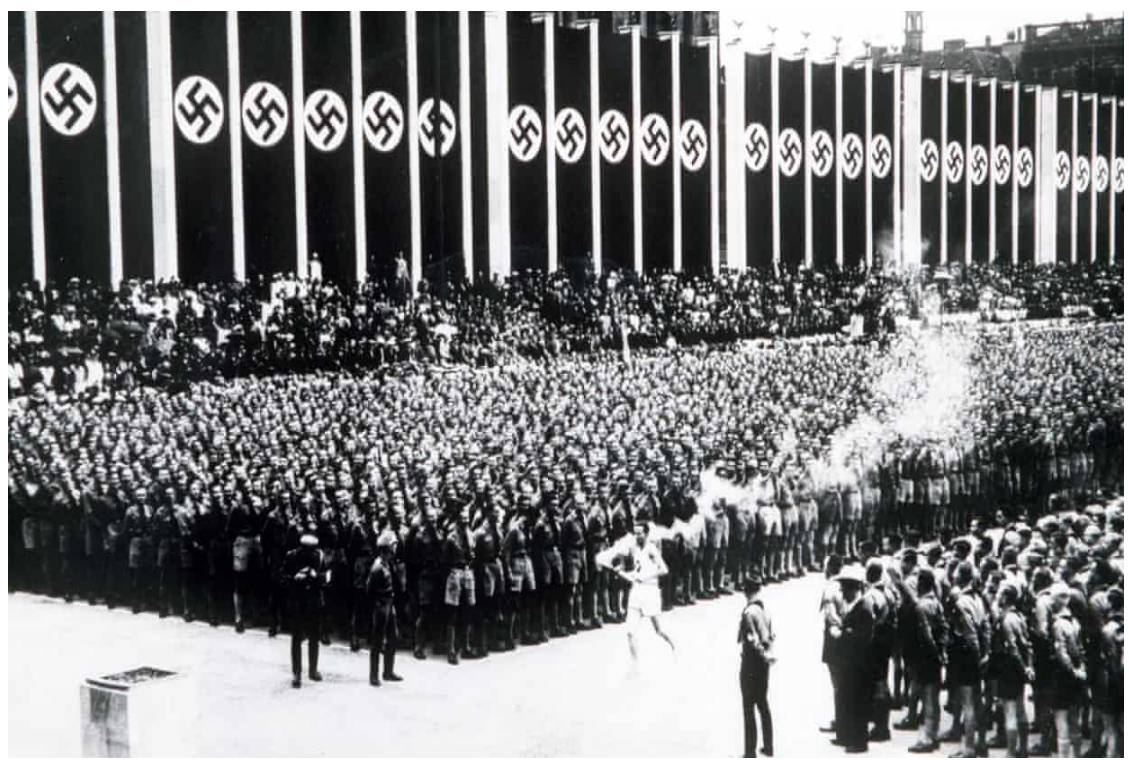
The Olympic flame arrives in the stadium surrounded by huge Nazi swastika flags.

Using advanced broadcasting technology that has never before been used to showcase the games, the Nazis had speeches and pamphlets that propagated their racial views to a global audience.<sup>37</sup> The Nazis successfully washed their image despite opening concentration camps and committing mass arrests and murders before and during the games.<sup>38</sup>