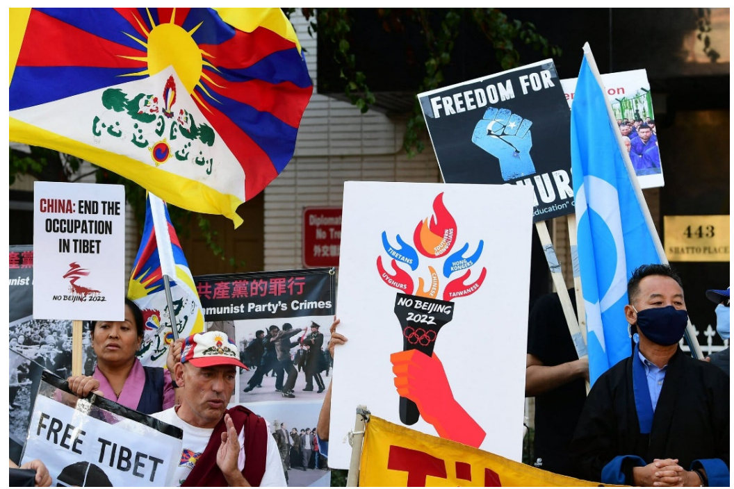
Activists called for a boycott of the Beijing Games at a rally in LA, CA in November 2021.

In the modern era of the Olympic Games, boycotts have become a showcase for major geopolitical disputes. Typically a specific action is provided as justification for the boycott, such as the Soviet invasion of Afghanistan during the 1980 games, but wider political tensions have also played a critical role in the use of boycotts.<sup>281</sup> Currently, diplomatic boycotting countries have cited the human rights abuses of the PRC against the Uyghur people as justification, but wider geopolitical tension with China has also escalated the tension.<sup>282</sup>