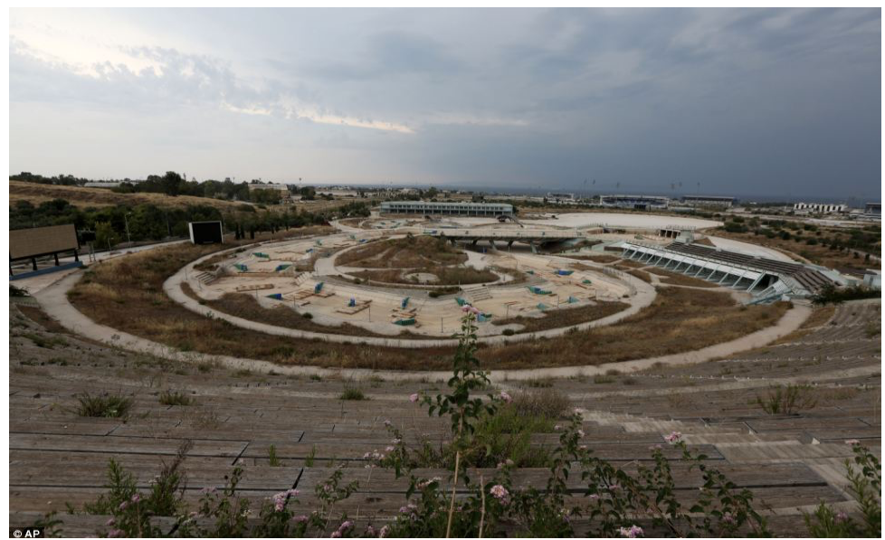
The Athens canoeing and aquatics centre at the former Helliniko Olympic complex now abandoned.

Almost ten years after the Bosnian War, the most devastating conflict since World War II, the Olympics hosted their 2004 summer Olympics in Athens, Greece. 143 Greece's support of Bosnian Serb forces during their attacks and ethnic cleansing efforts is little recognized. 144 Some Greeks may be considered to have aided the Serb Bosnian army during the Srebrenica genocide of July 1995. 145